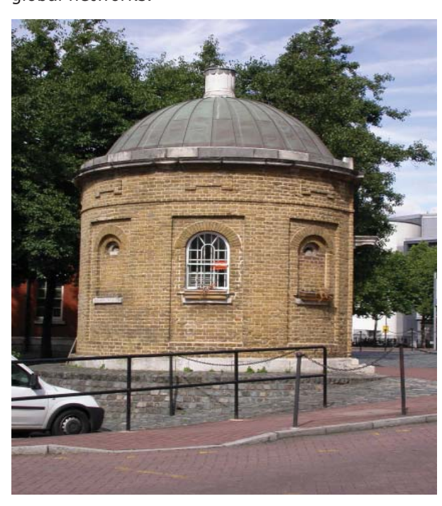
Fig. 4: The remaining round house at the West India Docks.

The metaphor of port is often used to describe the way networked entities function today. The port both prefigured contemporary global networks and remains active in them. In the heyday of the British Empire, the Thames drew everything from information, to cargo, to conflict into London. Through the progression of spatial responses from corporal punishment to controlling imports via enclaves, London's port was the site of the convergence of a network of imperial power struggles. In this way the nineteenth century port and its enclaves prefigured aspects of today's global networks.